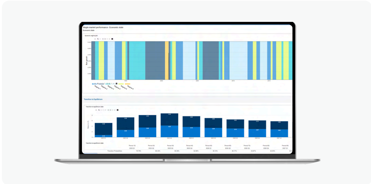
Exhibit 2: MIPS Economic State Model output screenshot

Within MIPS, portfolio managers can simulate allocations across markets and property types, then export the results to Excel for further analysis. Research professionals can also adjust forecast variables through a secure overlay interface, which writes custom inputs back to Snowflake without affecting global models. The system allows granular control over access, and user-specific changes are handled with strict governance through AWS APIs.